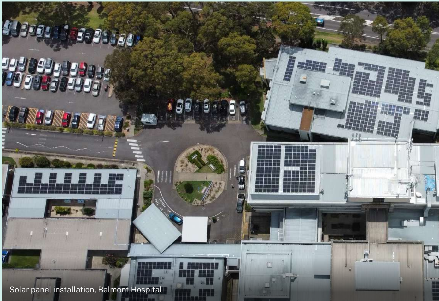
Solar panel installation, Belmont Hospital