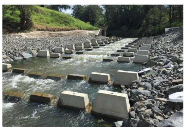
Value: $1 Million