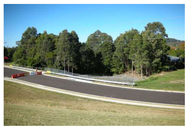
Value: $4 Million