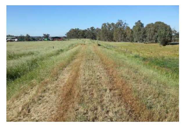
Value: $10 Million