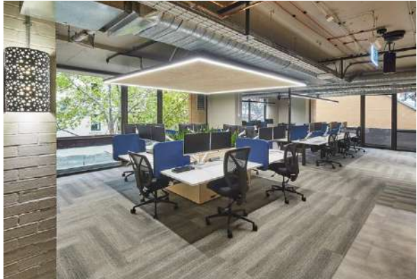
Value: $15 Million