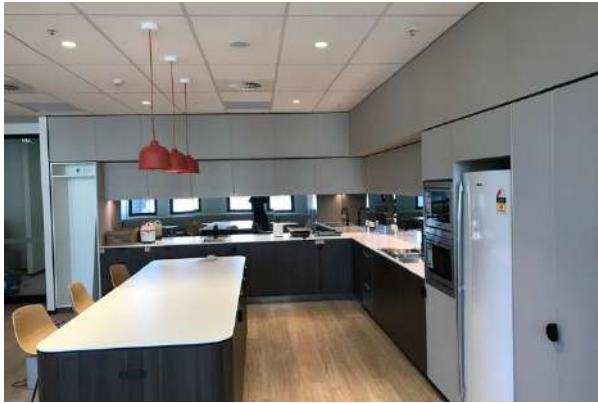
Value: $18.5 Million