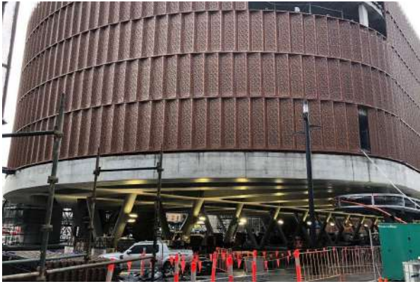
Value: $17 Million