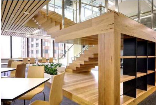
Value: $52 Million