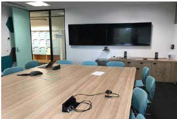
Value: $38 Million