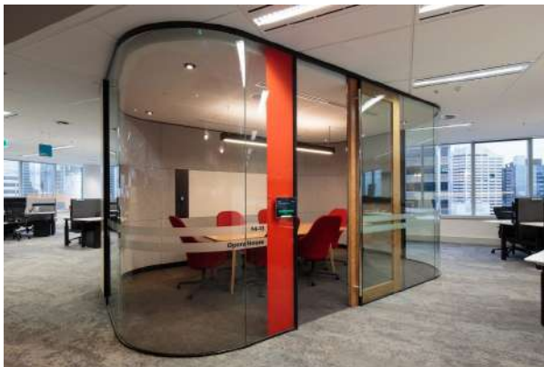
Value: $20.2 Million