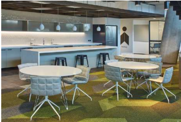
Value: $23 Million