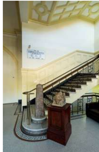
Lands Titles Office, internal refurbishment

The MSP team continued to provide training for regional council staff and RSL's in best practice methods of maintaining War Memorials to assist with the grants associated with the World War One Centenary.