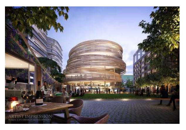
Value: $3.4 Billion